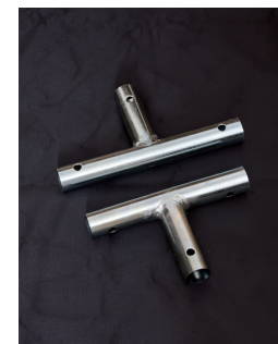
3-way brackets – standard (above) and small (below)