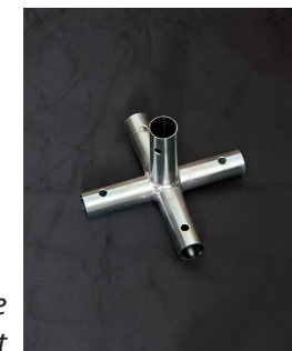
5-way centre bracket